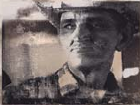
D RAY WHITE